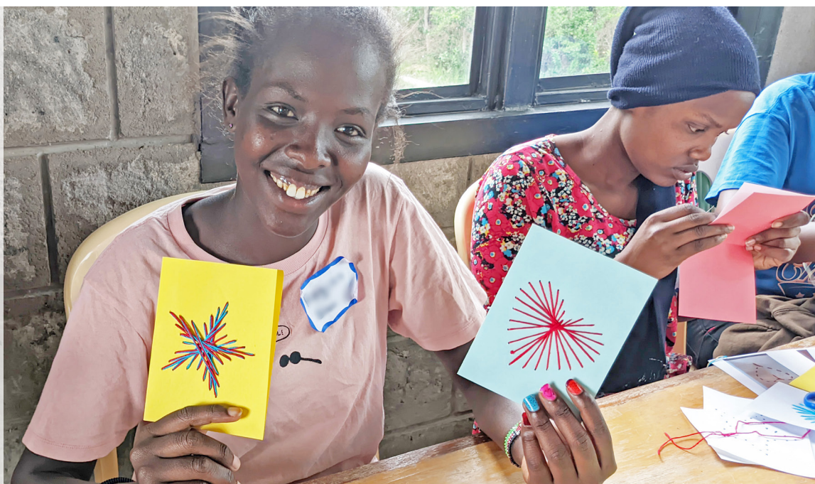
Girls learning life skills (in partnership with Saruni International) at the Girls' Rescue Center.

conducts innovative ministries geared towards mentoring and empowering children and youth, showing them the love of Christ and equipping them to become world changers and history makers of their generation. CMA offers these children a chance to achieve their dreams, giving them hope of a better life.