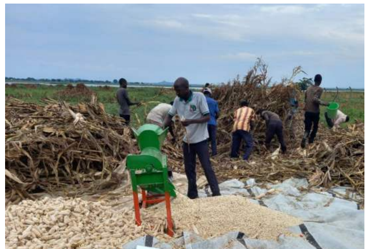
De-husking the maize harvest in preparation for sale at Orisai

200 members of the deaf community were empowered on financial and entrepreneurship skills in partnership with Kenyan partners. Through the skills and knowledge acquired, the deaf people will start new businesses or improve their existing ones.